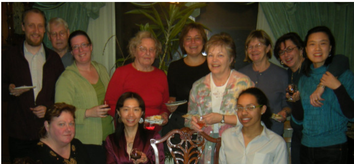
The ALC Choir — They pretend rehearsals are for singing , but really, it's mostly about friends.

Sing... Sing... Sing... Sing!!! All you've got to do is sing!